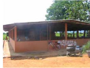
The new kitchen by Hope for life .