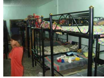
The new girls house and bunk beds